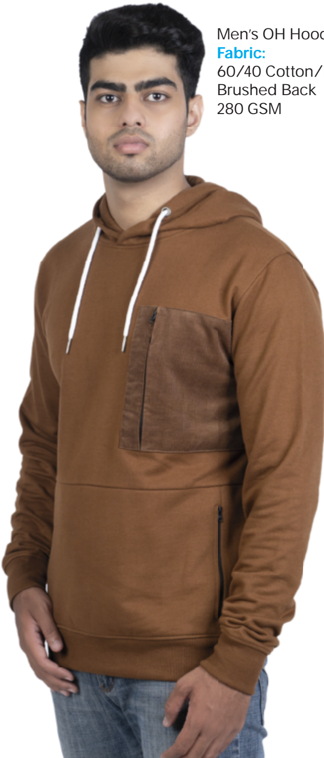
Men's OH Hoodie Fabric: 60/40 Cotton/Poly Brushed Back 280 GSM