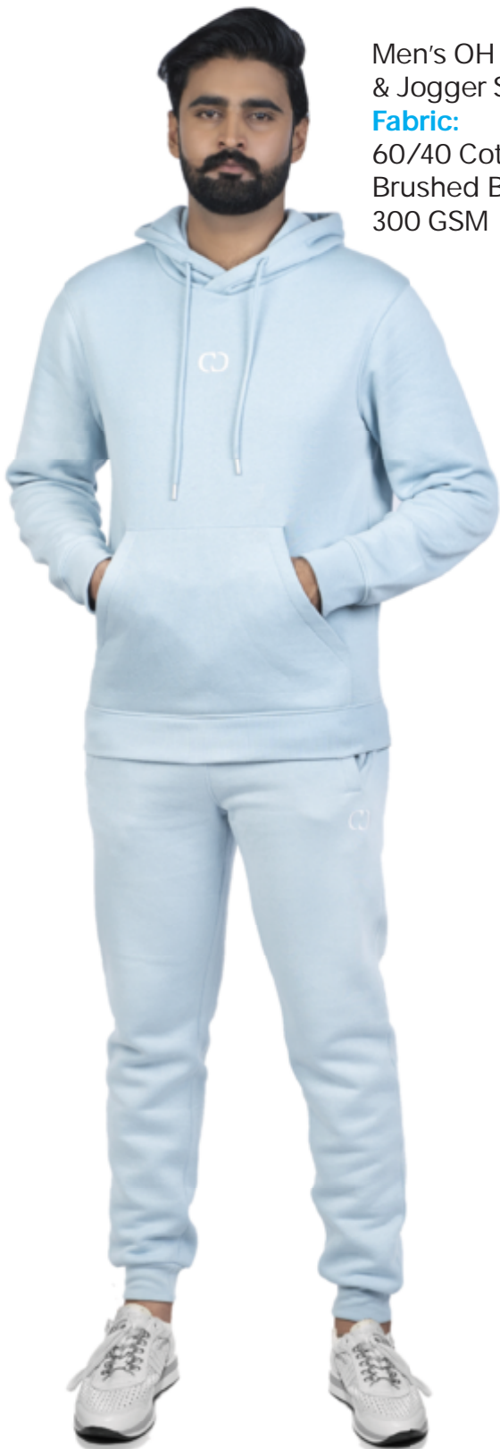
Men's OH Hoodie & Jogger Set Fabric: 60/40 Cotton/Poly Brushed Back 300 GSM