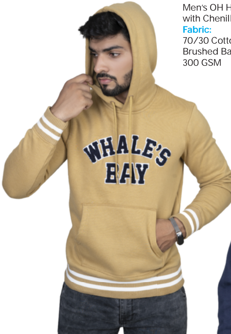
Men's OH Hoodie with Chenille Embroidery

Fabric: 70/30 Cotton/Poly sueded Brushed Back 300 GSM