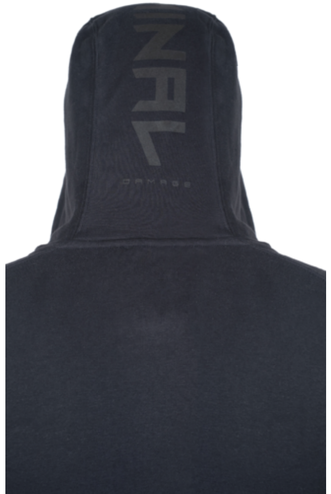
Men's OH Hoodie with Snood

Fabric: 80/20 Cotton/Poly Brushed Back With Bio Polish 320 GSM