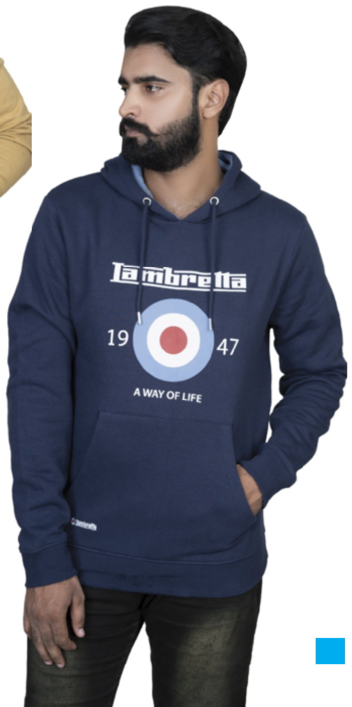
Men's OH Hoodie With Print

Fabric: 70/30 Cotton/Poly sueded Brushed Back 300 GSM