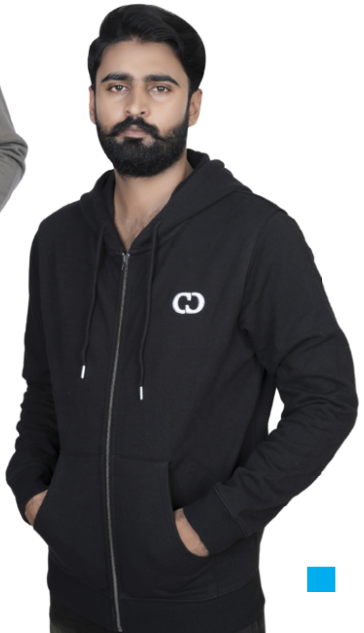
Men's Zip Up Hoodie with Raised Embroidery Fabric: 80/20 Cotton/Poly Loop Back 350 GSM