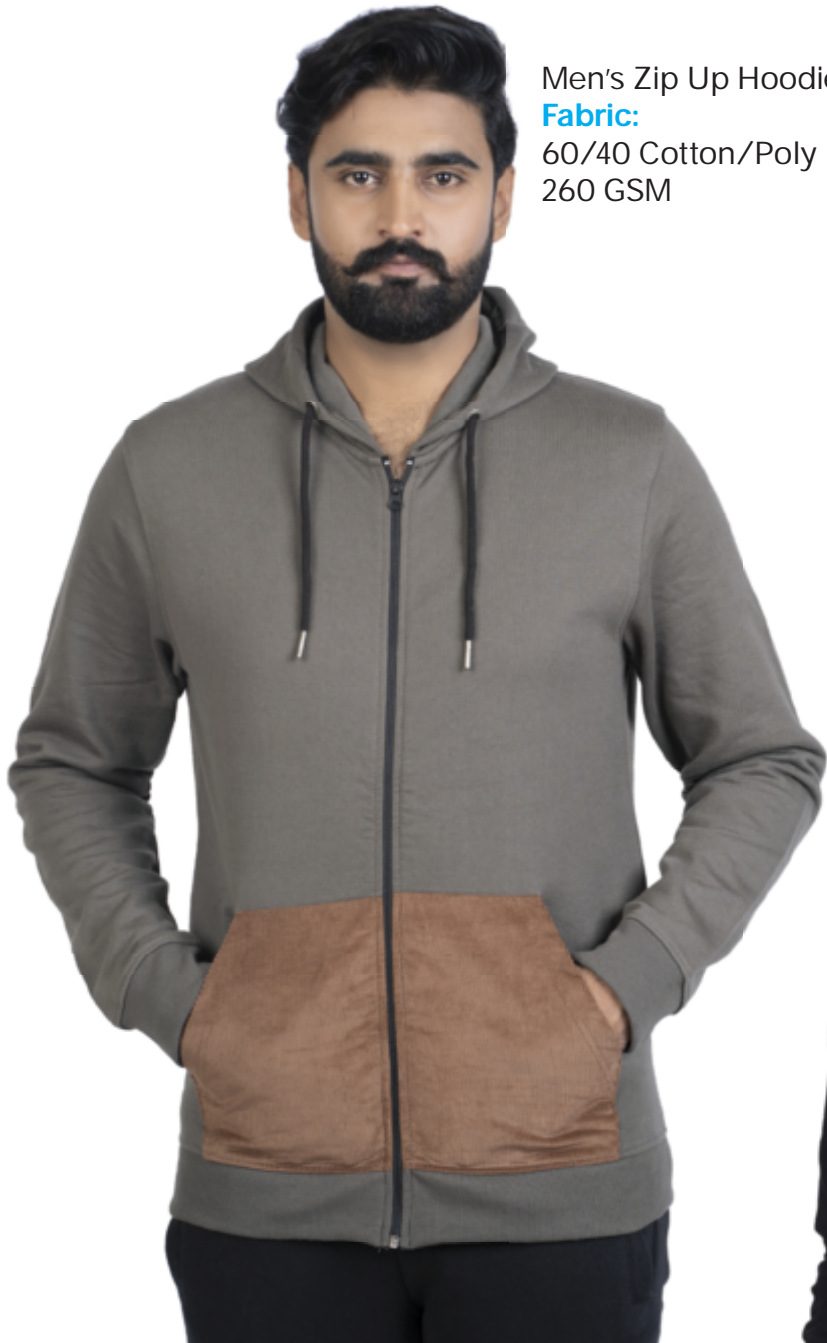
Men's Zip Up Hoodie Fabric: 60/40 Cotton/Poly 260 GSM