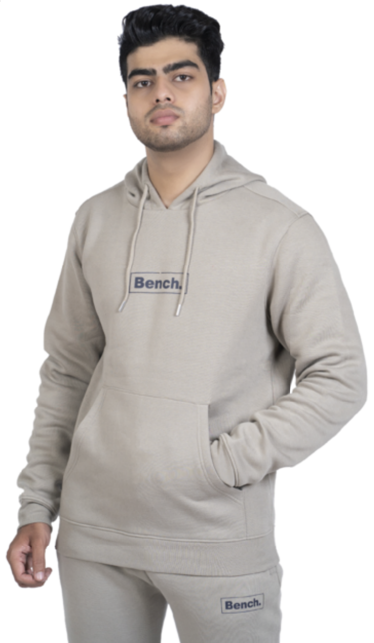
Men's OH Hoodie & Jogger Set Fabric: 60/40 Organic Cotton/Recycled Poly Brushed Back 280 GSM