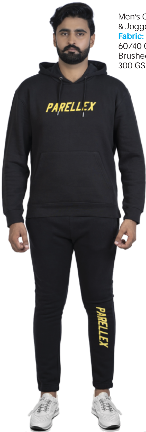
Men's OH Hoodie & Jogger Set Fabric: 60/40 Cotton/Poly Brushed Back 300 GSM