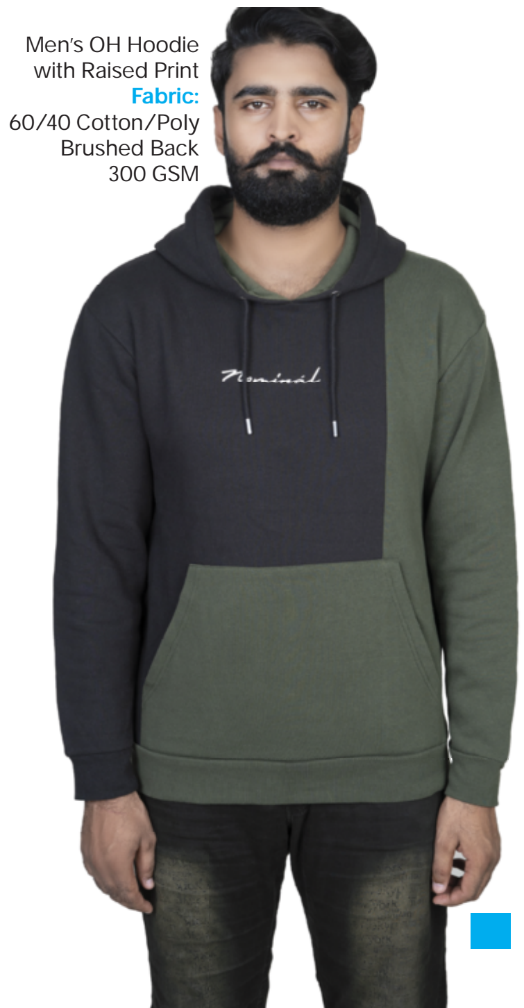
Men's OH Hoodie with Raised Print Fabric: 60/40 Cotton/Poly Brushed Back 300 GSM